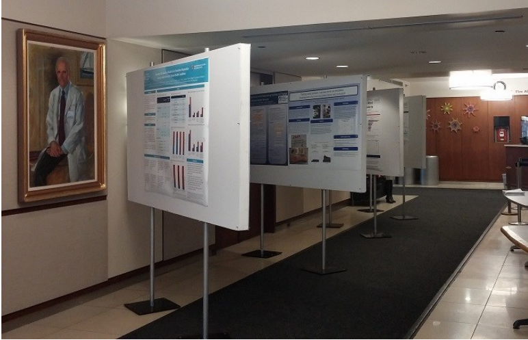
Abstracts submitted and presented pertaining to Graduate Medical Education in Enders Plaza on GME Day