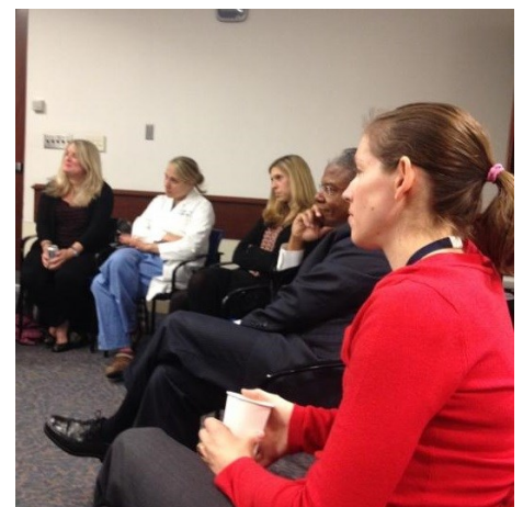
Participants of the Interactive Morning Seminar at GME Day, April 30th. Issues discussed were QI in the hospital setting, MOC, and issues surrounding certification